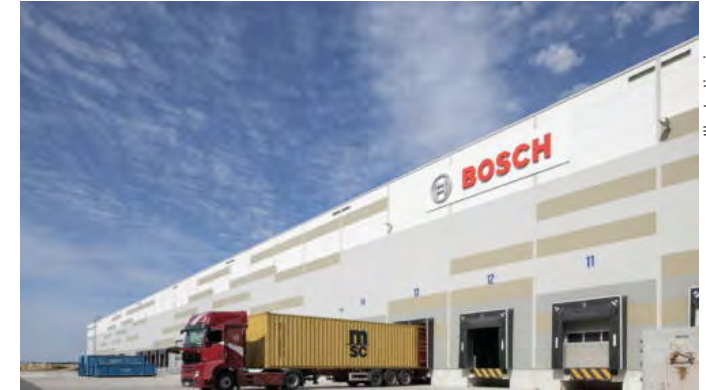
Flexible options for dock levellers and loading ramps