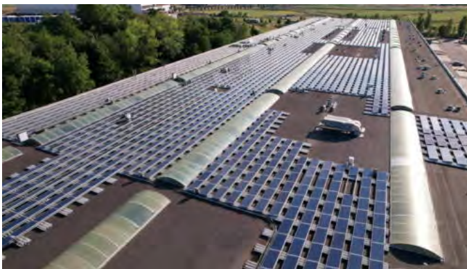
Energy efficient buildings built to BREEAM standards and high EPC ratings