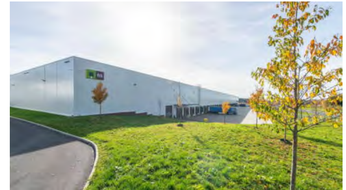
Landscaped green areas with year-round park management services