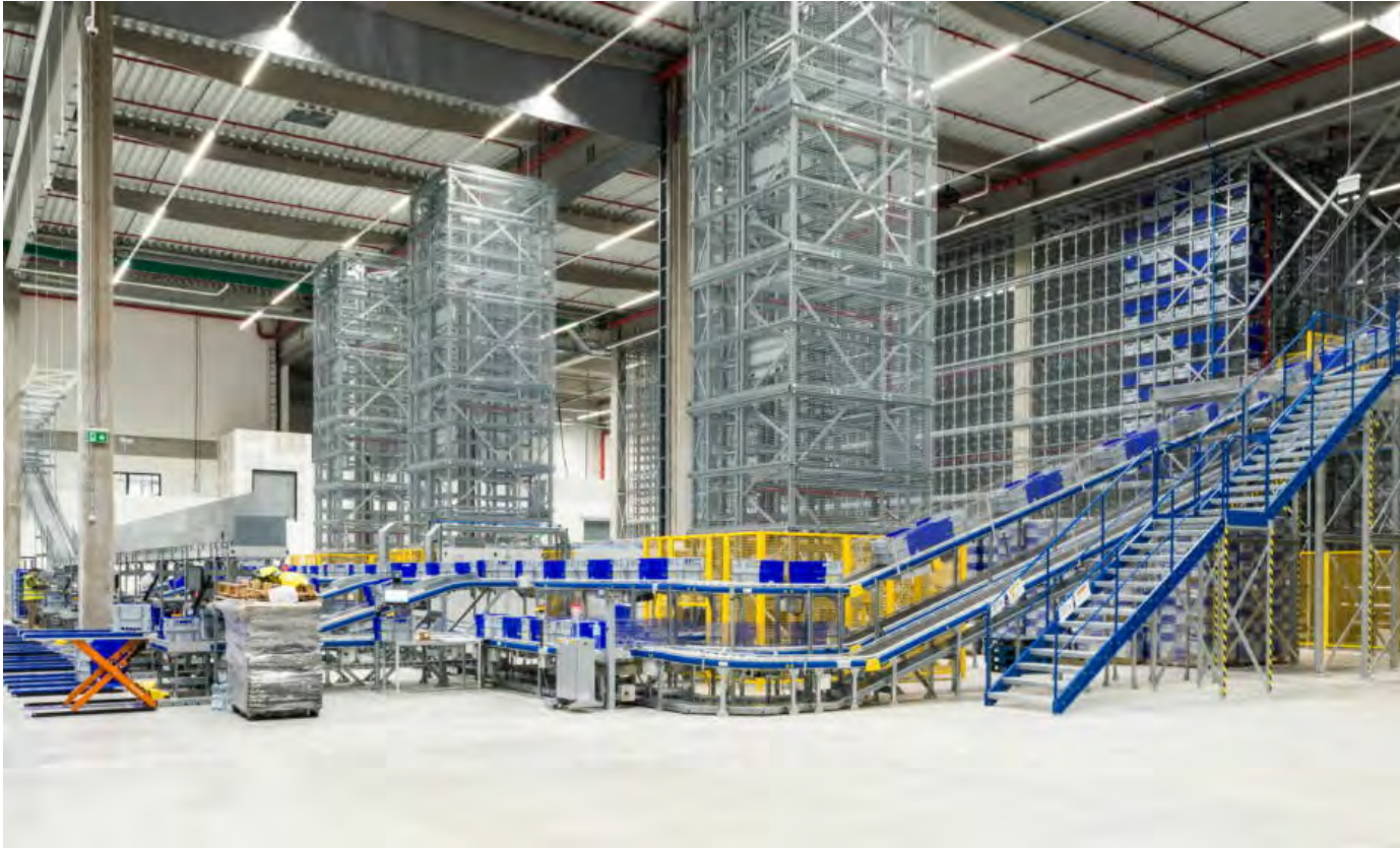
Turn-key, built-to-suit solutions to fit clients' exact requirements