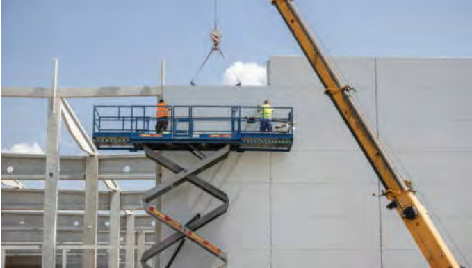
End-to-end development services including permitting, design, construction, project management, and facility management after move-in