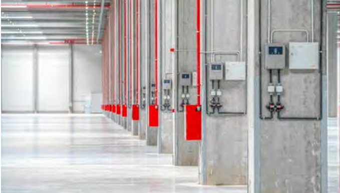
High quality standards including flexible 12x24 m grid, partition walls, sprinkler & fire safety systems, LED & natural lighting